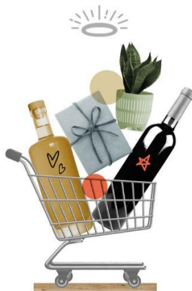
Make a purchase