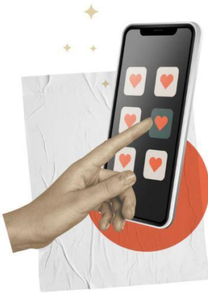
Choose a charity