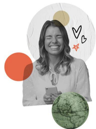
Make an impact